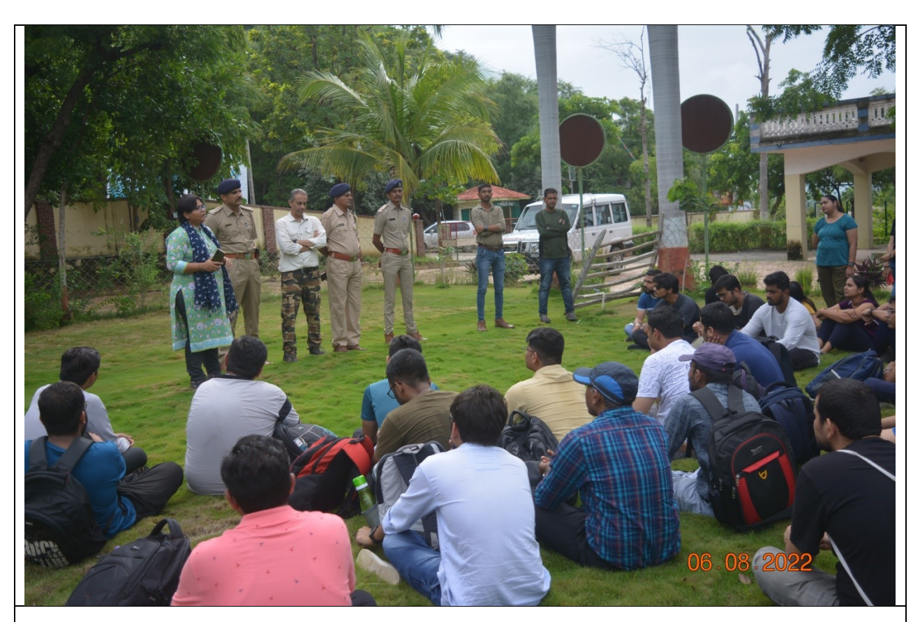
Glimpses Nature Trekking Programme at Jessore Sloth Bear Sanctuary on 06 August 2022